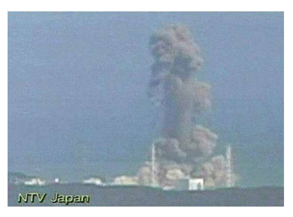
Fukushima Daiichi (end times part 1) O'Malley Family Bible Study Jan 18, 2012